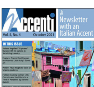
Accenti Newsletter October 2021