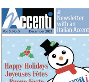
Accenti Newsletter December 2021