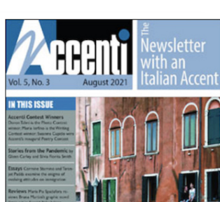
Accenti Newsletter August 2021

Visit the new Accenti Newsletter Archive!